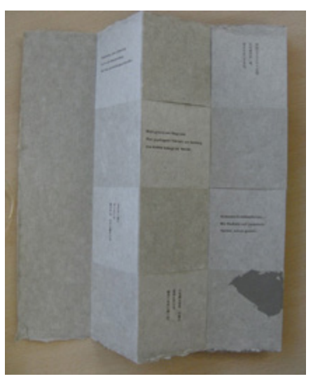
fig. 2 VERONIKA SCHÄPERS: PRAISE OF THE TAIFUN, 2004

Japanese form of poetry and deeply rooted in Japanese philosophy. Nevertheless, Grünbein has accomplished to adapt to the form. He accurately adheres to the rules of the haiku, conveying impressions from daily life that he picked up