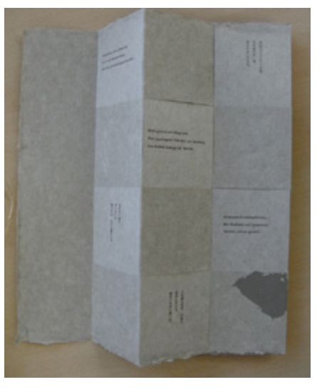
fig. 2 VERONIKA SCHÄPERS: PRAISE OF THE TAIFUN, 2004

Japanese form of poetry and deeply rooted in Japanese philosophy. Nevertheless, Grünbein has accomplished to adapt to the form. He accurately adheres to the rules of the haiku, conveying impressions from daily life that he picked up